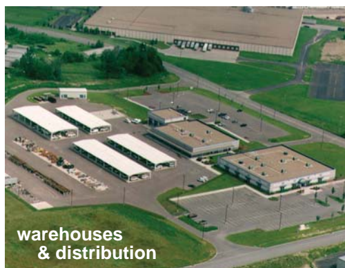
warehouses & distribution