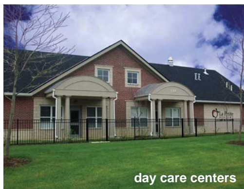
day care centers