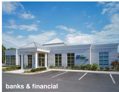
banks & financial